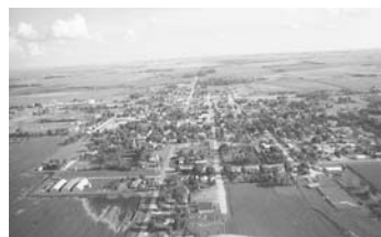
Serving the South Loup River Valley